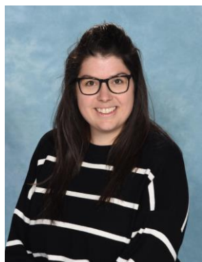
Miss Royal Class Teacher 0.2 (Monday)